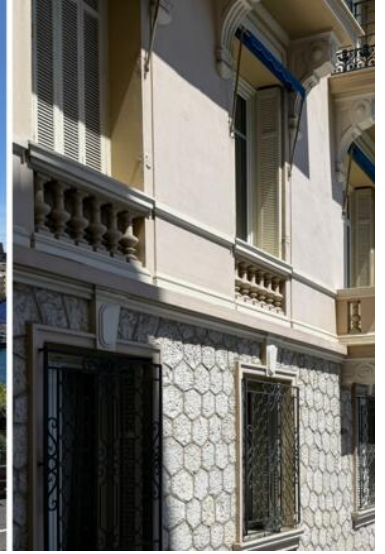
Avenue de la Costa