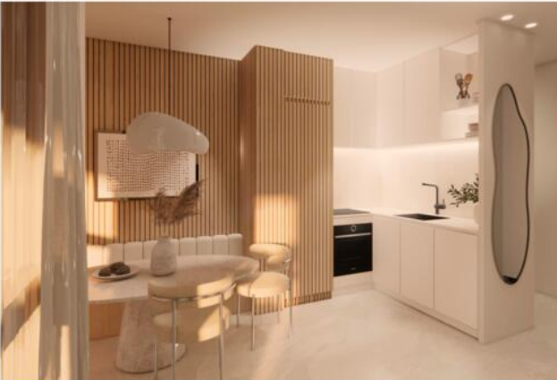
CUISINE + S MANGER