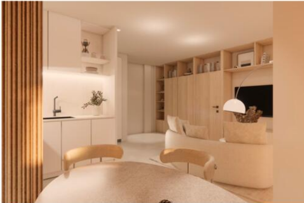
CUISINE + SA MANGER