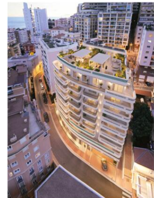
Plans, images, textes et surfaces non contractuels.

MAÎTRE D'OUVRAGE SCI NETTANI Représentée par Monsieur Eric SEGOND GRUPE SEGOND PROMOTION 45 Rue Grimaldi - 98 000 Monaco - Tél: +377 92 05 35 77