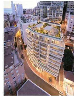
Plans, images, textes et surfaces non contractuels.

MAÎTRE D'OUVRAGE SCI NETTANI Représentée par Monsieur Eric SEGOND GRUPE SEGOND PROMOTION 45 Rue Grimaldi - 98 000 Monaco - Tél : +377 92 05 35 77