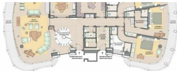
Master bedroom floor :