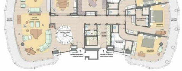
Master bedroom floor :