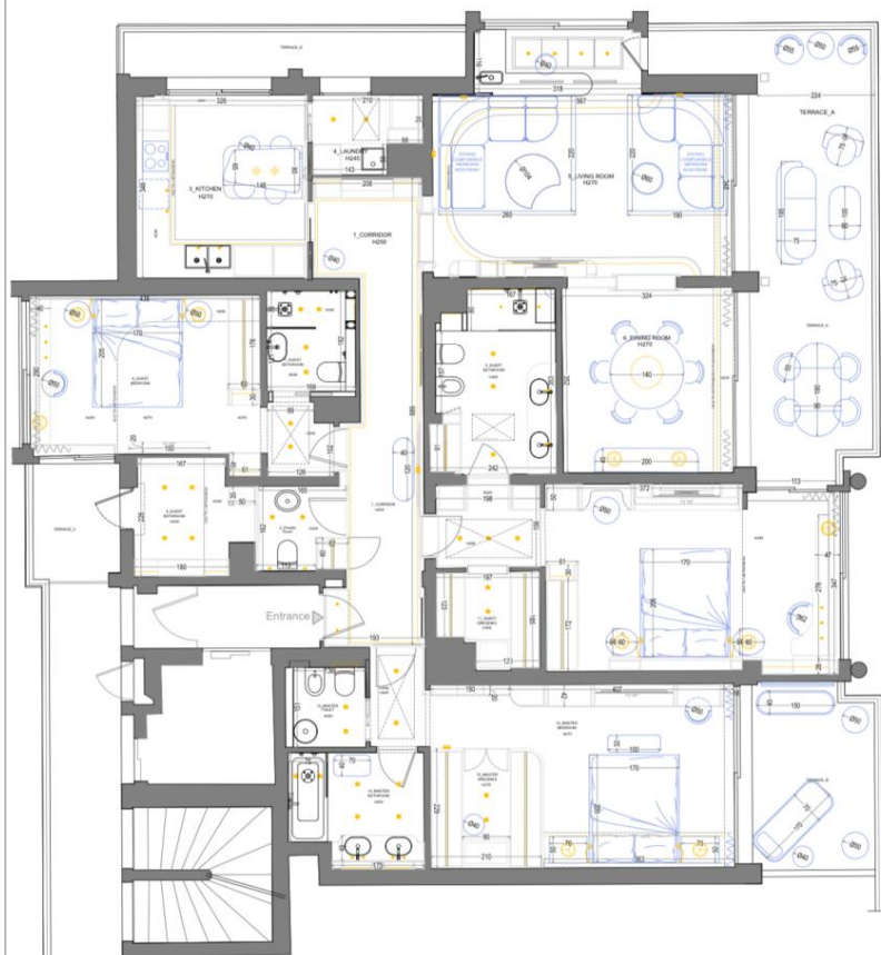
RIVIERA - Layout Definitivo - ARREDI QUOTATI