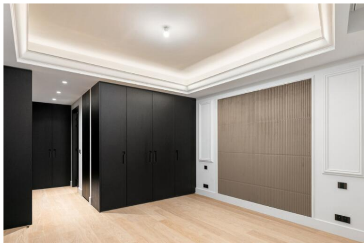
Premier appartement de série | First series flat | Primo appartamento della serie

Photos non contractuelles | Non-contractual photos | Foto non contrattuali