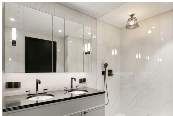
Premier appartement de série | First series flat | Primo appartamento della serie

Photos non contractuelles | Non-contractual photos | Foto non contrattuali