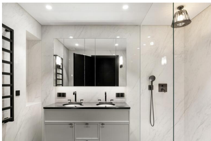
Premier appartement de série | First series flat | Primo appartamento della serie

Photos non contractuelles | Non-contractual photos | Foto non contrattuali