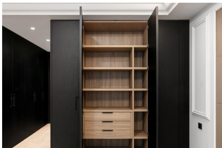
Premier appartement de série | First series flat | Primo appartamento della serie

Photos non contractuelles | Non-contractual photos | Foto non contrattuali